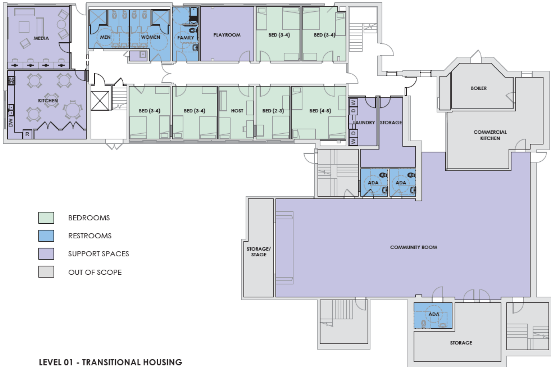
LEVEL 01 - TRANSITIONAL HOUSING